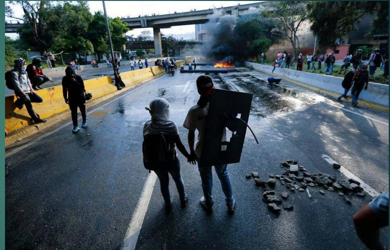
A couple holds hands at a road block set by anti-government protesters in Caracas, Venezuela. Protesters shut down the capital city's main highway to express their disgust with the administration of President Nicolas Maduro.